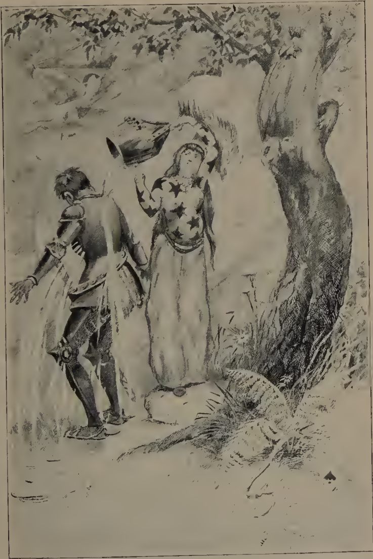
HOW REFRESHING IT WAS